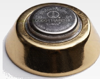
Above image depicts Assembled Mount & iButton

Click Here for Link to video clip. If Link does not work, please copy & paste the address below into your address bar in your Browser Window. Video Clip is in mpg format.